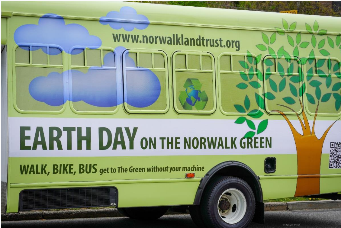
The Norwalk Transit District joined in publicizing the Earth Day event with this bus advertisement.