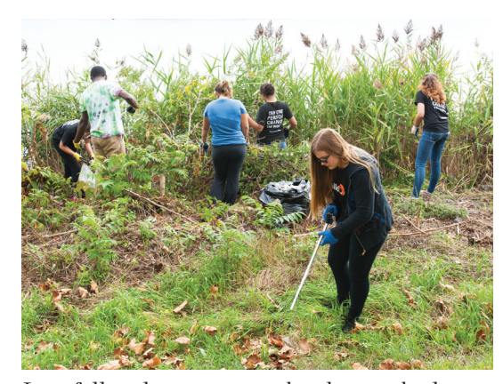
Last fall, volunteers were hard at work cleaning up trash at Oyster Shell Park.

There is a constant need for maintaining NLT open-space properties. Trash of all kinds – including plastics, metal, tires and more – is collected, invasive plants are removed, and this year the project to transform Hoyts Island into a wildlife preserve continues with work under way to remove or bury the foundation ruins on the property.