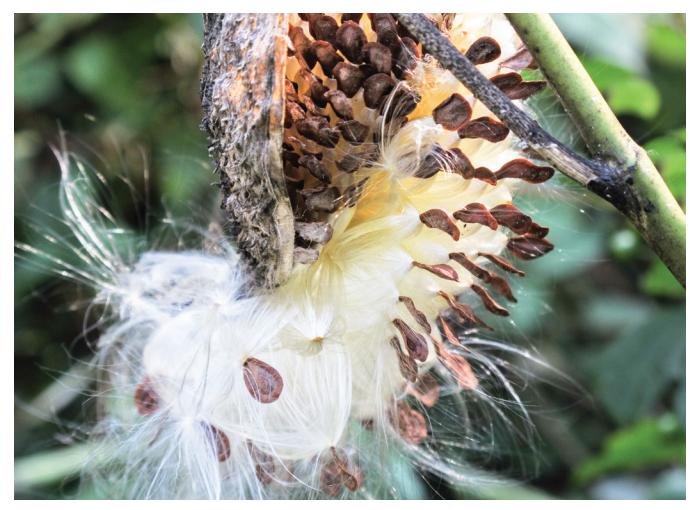
Milkweed seeds ready for harvesting.

The Norwalk Land Trust will again have a booth at the Tree Festival on May 16 from 10-3 at Cranbury Park green. We are planning an exhibit on common invasive plants and their native alternatives. The featured invasive plants are asiatic bittersweet, burning bush and barbery with suggestions for alternative native plants. We will have pictures of both invasive plants and their native alternatives and lists of those alternatives. We will also have milkweed plants and seeds, seeds of native perennials, and "seed bombs" to toss into sites where wildflowers will grow. Come join us at the Festival!