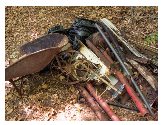
A sample of trash collected from Little West Cedar by a group of board members and dedicated volunteers.

For more information, please visit our Web site: norwalklandtrust.org or e-mail us: info@norwalklandtrust.org