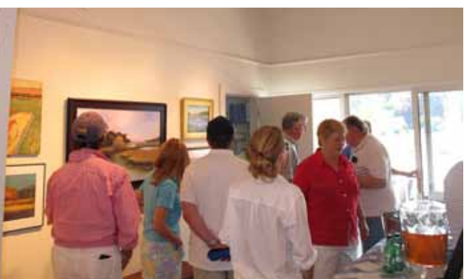
The opening reception in the Rowayton Arts Center's Portside Gallery was well attended.