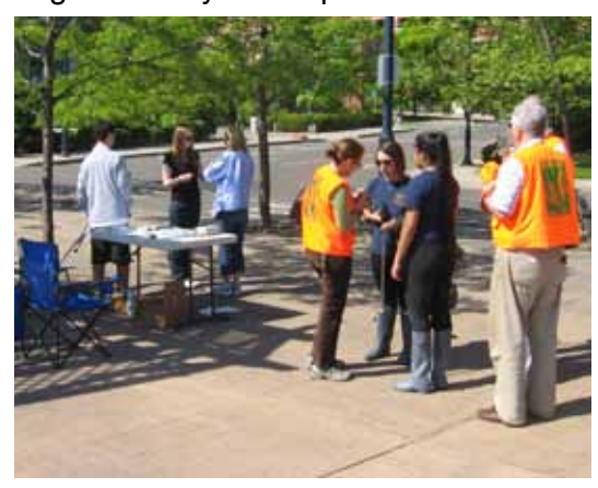
NLT board members and volunteers organize and sign on for the cleanup.

Together with the Norwalk River Watershed Association, the Trust organized its second Spring cleanup of the Norwalk River's banks just North of the Maritime Aquarium, on May 19. The "haul" was smaller than in 2011 given the closure of Oyster Shell Park for renovation, but the Trust reported some 900 pounds of litter removed. Save the Sound, as part of a statewide effort, contributed gloves and bags to defray cleanup costs.